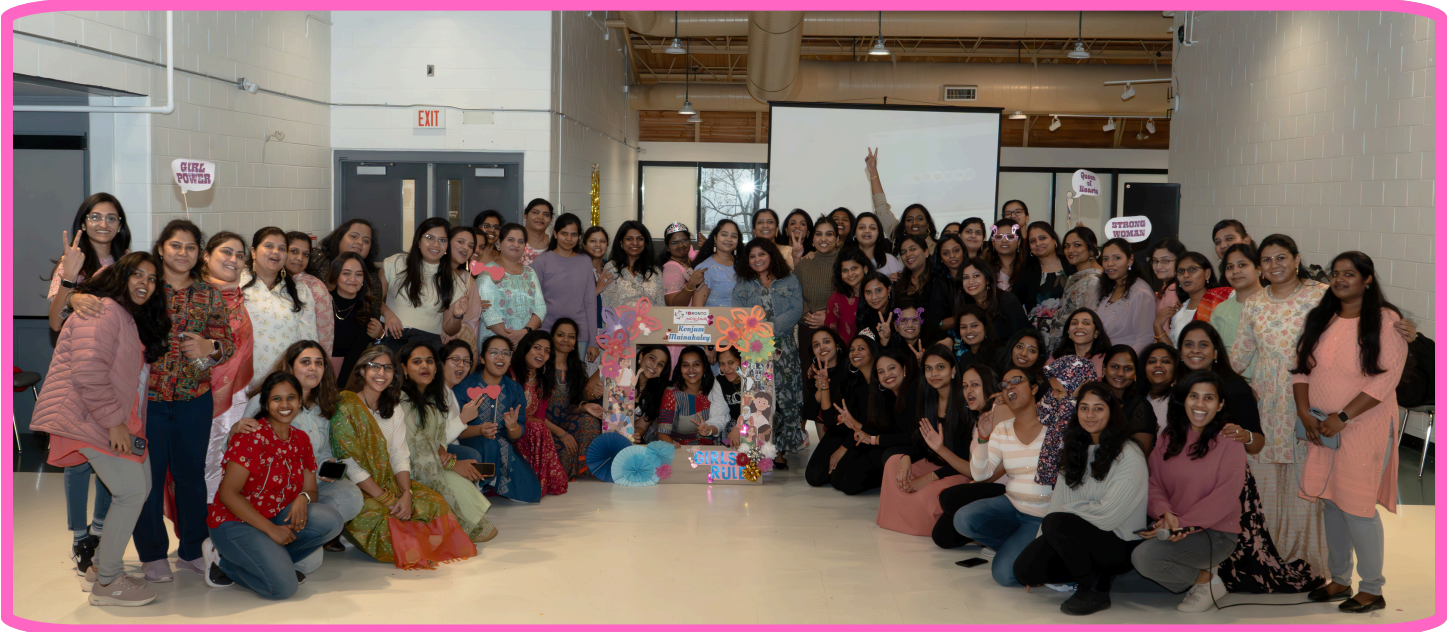
Women's Meet up - March 2024

As we reflect on this memorable event, we are reminded of the strength and resilience of women in our community. Their stories inspire us to continue championing gender equality and creating opportunities for women to thrive. We look forward to many more empowering gatherings that celebrate the diverse talents and contributions of women in our community.